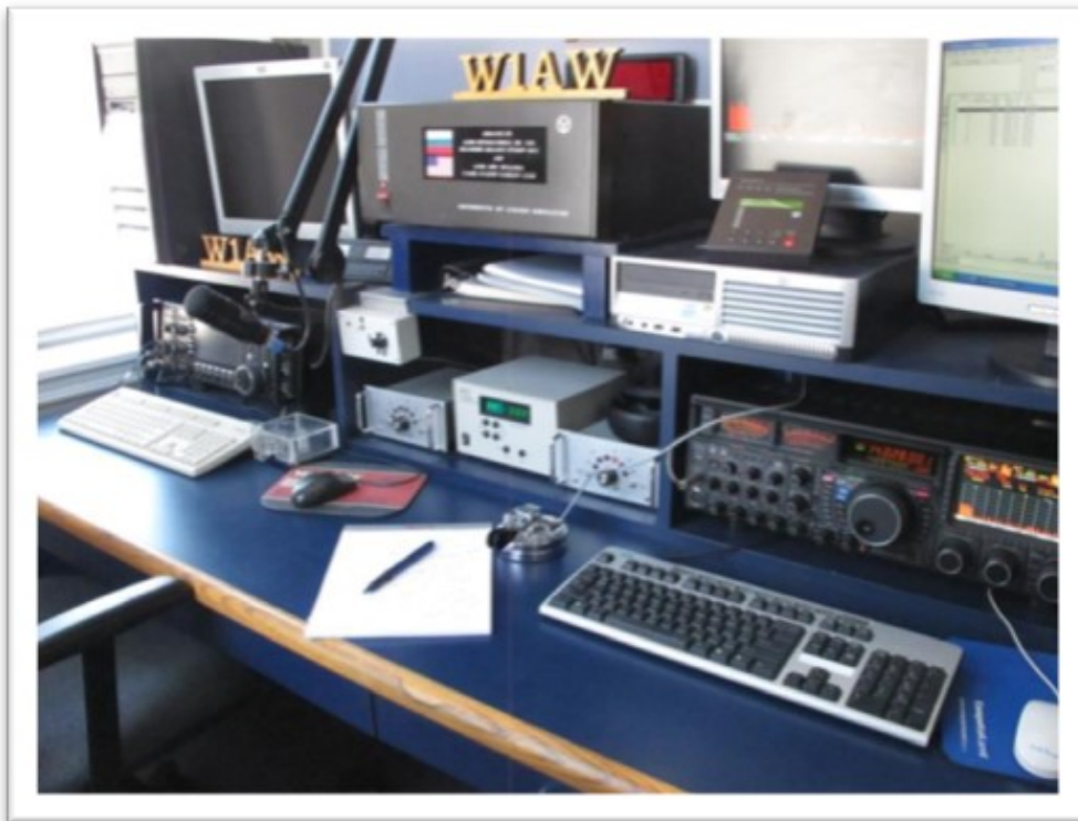
ARRL Guest Operating Position

You also have the opportunity to enter the ARRL Sweepstakes Contest (until December 2025).