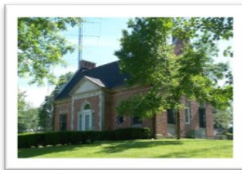
ARRL Headquarters, Newington, CT